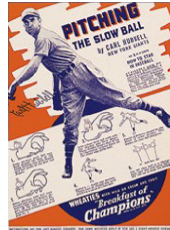
Carl Hubbell: 1938 Baseball

Wheaties broadcasts also led to the film career of Ronald “Dutch” Reagan, a sportscaster from Des Moines, Iowa, who made play-by-play re-creations of Chicago Cubs games using telegraph reports. In 1937, Reagan was voted the most popular Wheaties announcer in the country and was awarded a trip to the Cubs’ spring training camp in California. While there, he took a Warner Brothers screen test and subsequently became a popular film star. He later went into politics and became the 40th president of the United States.