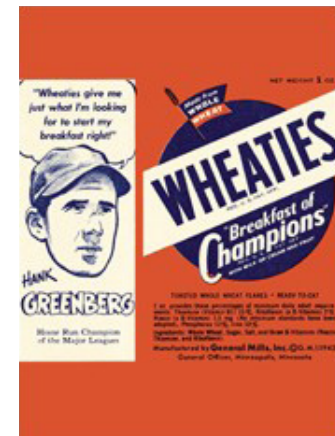
Hank Greenberg: 1947 Baseball

Finally, on the basis of consumer research and marketing statistics, the company made a crucial decision: abandon sports and go after the children's cereal market—a heavy per capita consumption group. In place of athletes, Wheaties began associating itself with the Lone Ranger and the Mickey Mouse Club. More youngsters began eating Wheaties, but not enough to offset the decline in adult consumption. Sales dropped more than 10 percent in one year.